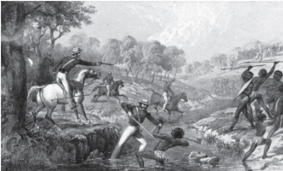
Figure 2. Mounted Police and Blacks (1852). Godfrey Charles Mundy. Australian War Memorial. This painting depicts the killing of Aboriginals at Slaughterhouse Creek by British troops.

outposts were intimately connected back to their colonising oppressors. Hence colonial legal regimes did not develop as separate isolated entities, but in collaboration the centralised systems of the colonisers. 37 In short, colonies emerged over time as intricately entangled hybrid societies incorporating European and non-European laws, values and sensibilities. 38