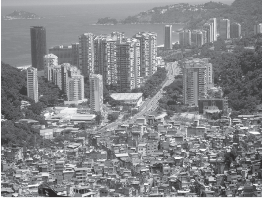
Figure 1. Rochina Favela, Rio de Janeiro, Brazil. 21 March 2008. This is one of the largest shantytowns in South America with over 200,000 inhabitants. There are many such slums existing alongside modern high-rise buildings in cities of Brazil. Those who live in these shanty towns prefer its prime location next to the city centre, as they can earn a living being close to the city.

tries' social agendas. 20 According to James Ferguson, 'Social policy and nation-state are, to a very significant degree, decoupled, and we are only beginning to find ways to think about this.' 21 As a result, these contradictory socioeconomic reconfigurations of power have fundamentally altered domestic relations within states, as well as profoundly altering the world of international relations that can no longer be conceived solely in terms of interstate activities.